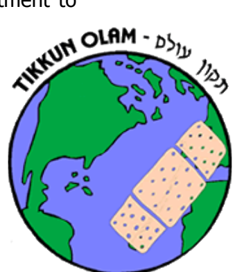
BE A PIECE OF THE PUZZLE

Hillel, the Israeli Police Force and the Israel Organization of Community Cen-