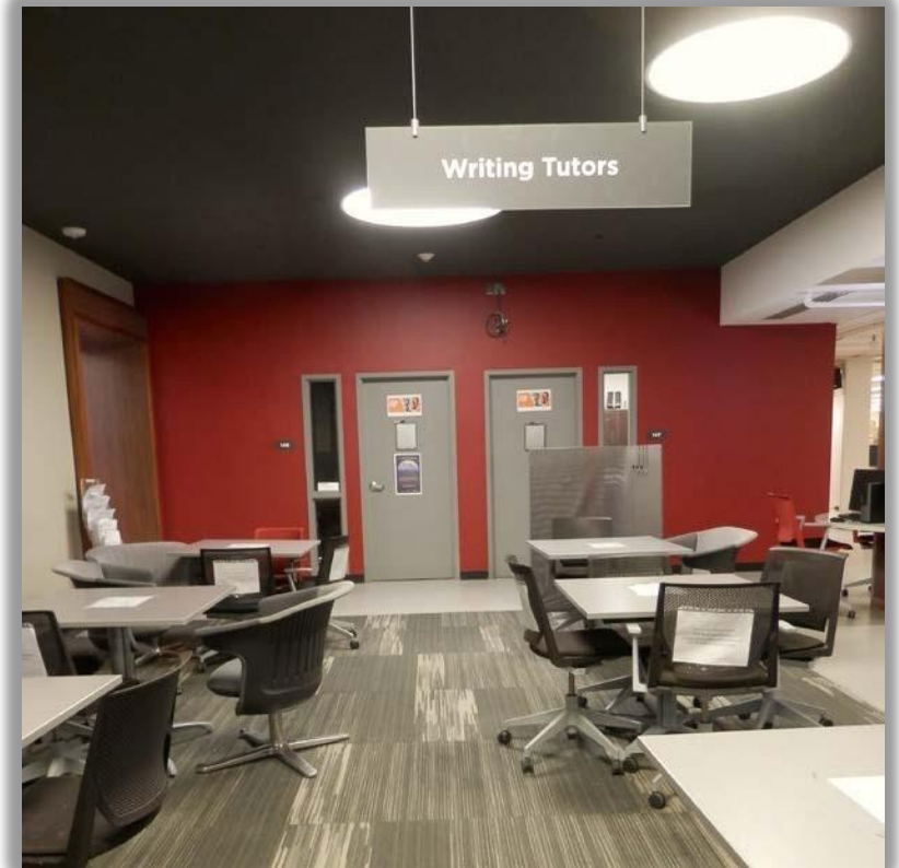
First floor, Elizabeth Dafoe Library.