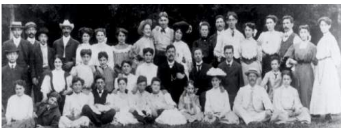
Women and men strikers from the Scotland Woollen Mills Co. (484 Main Street) gather at St. John's Park, Winnipeg 1906.