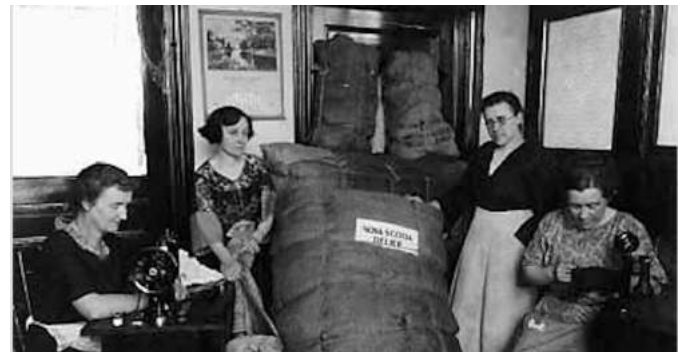
Members of the Women's Labor League preparing relief bundles for Nova Scotia Coal Miners, c. 1925

*See http://www.mhs.mb.ca/ or www.mhs.mb.ca/docs/mb_history/11/women1919strike.shtml