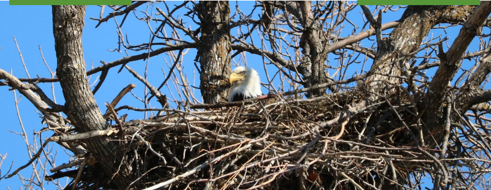
EAGLE AT POINT, APRIL 2024